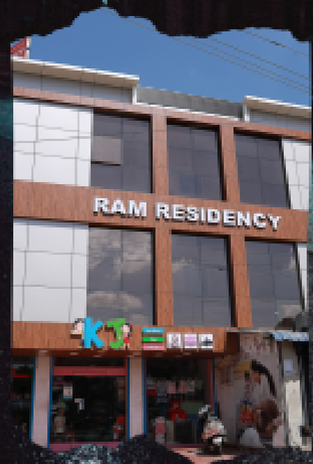
RAM RESIDENCY 15KM (21MINS) 4km Away From Vandalur Zoo (Towards Chengalpattu)

GUIDE POST FOR THE VISITORS WHO WISH TO STAY IN HOTELS ON THEIR OWN EXPENSE