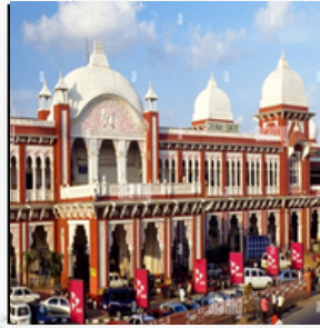
MGR Central Railway Station

Tirusulam Suburban Train Station ( at walkable distance)