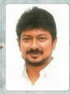
Thiru. Udhayanidhi Stalin Hon'ble Minister for Youth Welfare & Sports Development Department Government of Tamil Nadu