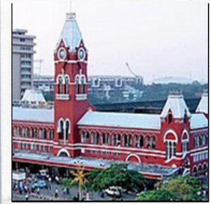
Chennai Egmore Railway station

Chennai Park Suburban Train Station (at walkable distance)