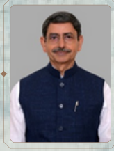
Hon'ble Shri. R.N.Ravi The Governor of Tamil Nadu